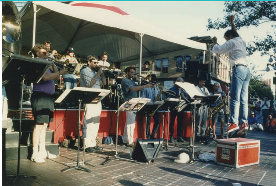
Hard Rubber Orchestra at Gastown Jazz. File photo