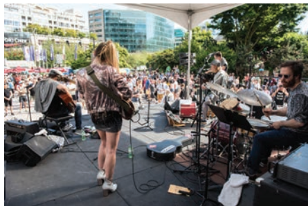
Star System at the 2017 Festival.

There's a reason this festival is here—and it's our players, our venues, and the collective commitment to this music. If you're lucky enough to live here, you get to experience them all year round. 🎵