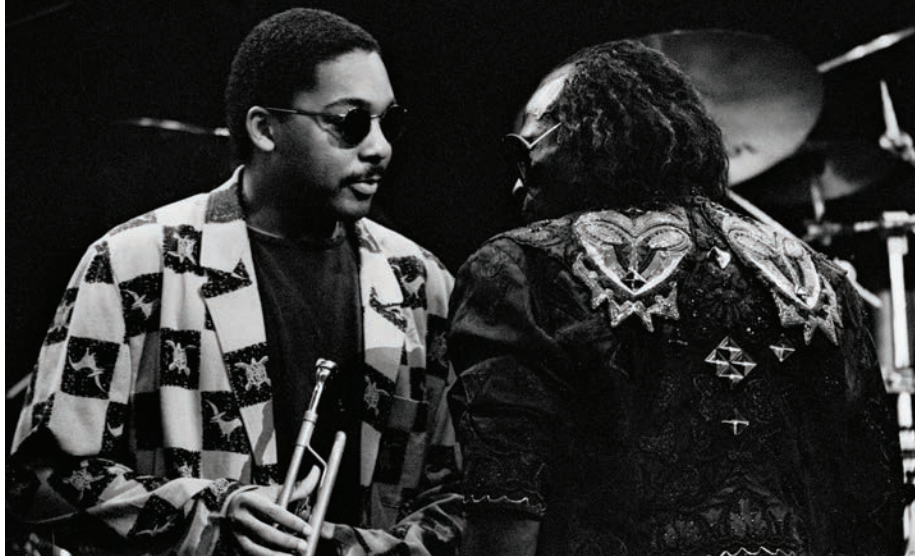
Wynton Marsalis & Miles Davis.

rapid rise of Diana Krall from resident artist to international star; the zany concert antics and awesome talent of Dutch master drummer Han Bennink all leap to mind. Equally unforgettable is trombonist Ray Anderson jamming with John Zorn and the Sonny Clark Memorial Quartet late into the night, and Brazilian singer/songwriter Caetano Veloso's mesmerizing show at the Vogue Theatre. And I'm only scratching the surface.